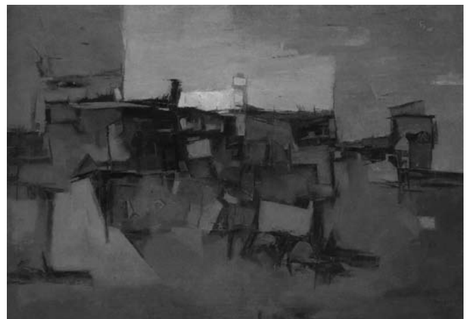
"Spring" by Ram Kumar

The Caleb Group has received a gift from an anonymous donor of $100,000. This new, unprecedented gift is opening a new chapter in giving to The Caleb Group. With this gift, the donor hopes to challenge others to give to The Caleb Group. The story behind the gift is most interesting. The donors stated that the donation money came from the sale of a painting that had been hanging in their living room for thirty years.